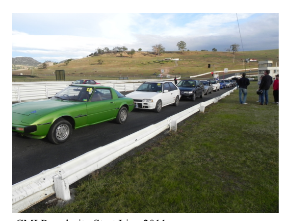
CMI Regularity Start Line 2011