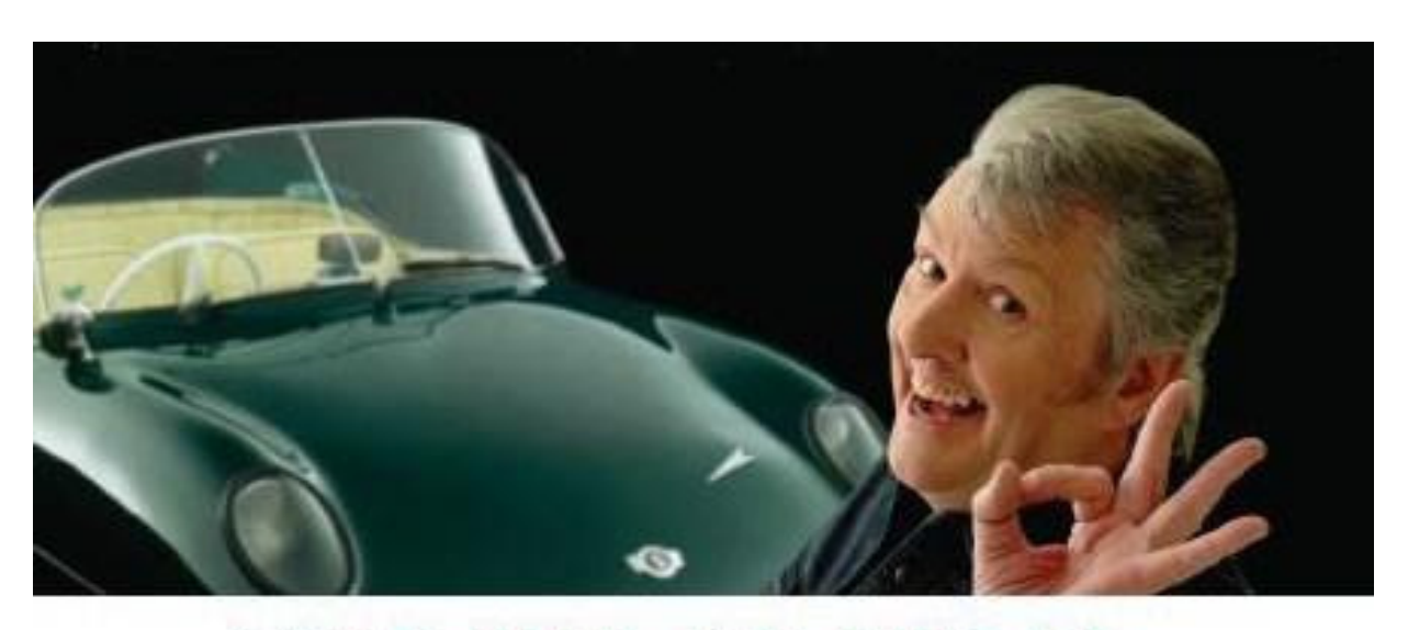
"SHE WAS SO SWEET, SO PERFECT. STILL IS."